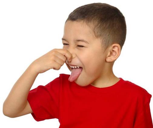
Kid holding his nose from bad odor.

Hydrogen sulfide is a gas that gives water a distinctive "rotten egg" odor. Various treatment options are discussed in this article.