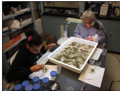
Step 2: Volunteers sort BMI by family

chemical tests, BMI assessment requires more active participation by volunteers as it takes more time and effort than simply filling a sample bottle. In the process, volunteers get to immerse themselves a little more deeply in stream ecology.