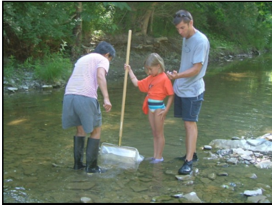
Step 1: Volunteers collect BMI samples using a kick net

Benthic Macroinvertebrates (BMI) are aquatic invertebrates that live on stream bottoms. BMI include a wide variety of insects (during one or more stages of their life cycles) and other small aquatic organisms. They feed on algae or decomposing organic matter from local landscape sources such as leaf litter. BMI are at the base of both aquatic and terrestrial food chains. Sometimes, they even eat each other!