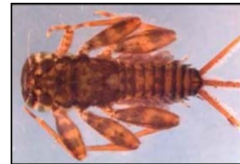
Mayflies (above) tend to be more sensitive to water pollution so they are usually present in non-impacted