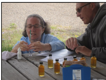
Red Flag Volunteers test samples for Dissolved Oxygen

In 2012, CSI began its first-ever membership drive and would love to have YOU as a member! We are almost halfway to reaching our $10,000 goal and we need your help to get there!