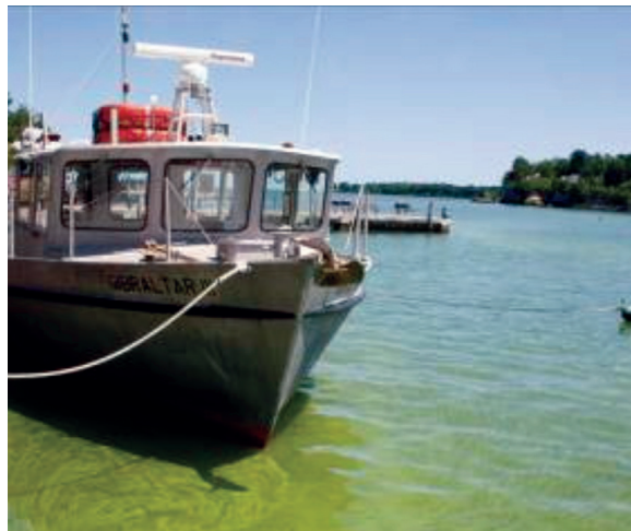
A cyanobacterial bloom in Lake Erie. It’s impossible to tell visually, by taste or odor whether such a bloom is toxic (a HAB). Water samples must be analyzed for the presence of toxins.

If you suspect your dog has been exposed to cyanobacterial toxins, seek immediate veterinary care. You can also contact various pet poison hotlines (listed in this brochure) for more information. Untreated, cyanobacterial poisonings are usually fatal in dogs. Even in cases where a poisoned dog receives prompt veterinary care, the outlook for a dog is often poor and the dog may not fully recover. Veterinary care can last a few days to several weeks.